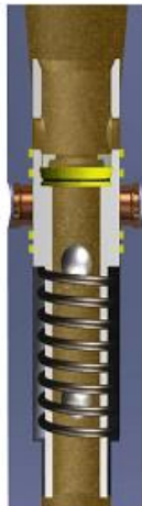
Balls Sheared Thru Seat Tool Reset