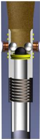
De-Activation Balls Dropped PRESSURE UP