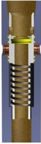
Drilling Mode FLOW to BIT