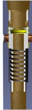
Drilling Mode FLOW to BIT