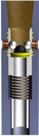
De-Activation Balls Dropped PRESSURE UP