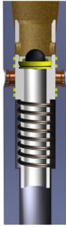
Activation Ball Seated